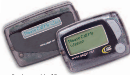
Rechargeable SP5 (NiMH)